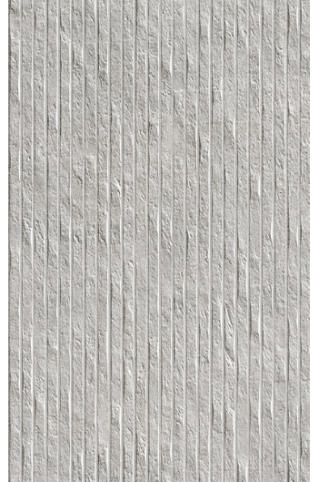
25 x 40 cm (10" x 16") Brick Relief Decor GE.GN.GRY.1016.MT.DC