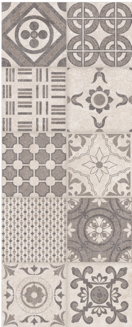
TAUPE PATCHWORK DECOR 20 x 50 cm (8" x 20") GE.GN.TPE.0820.MT.DC