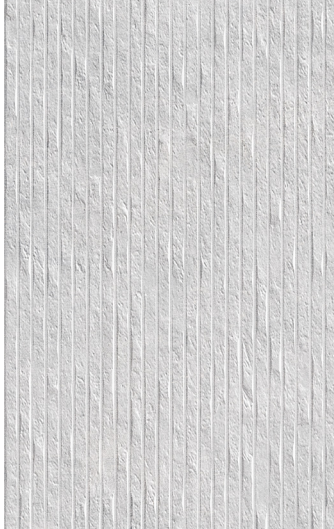
25 x 40 cm (10" x 16") Brick Relief Decor GE.GN.LGR.1016.MT.DC