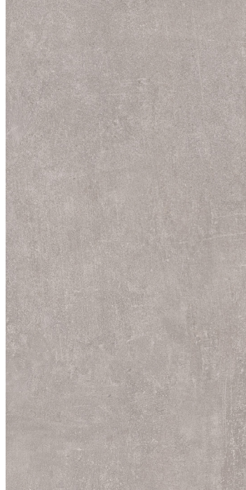
30 x 60 cm (12" x 24") GE.GN.TPE.1224.MT