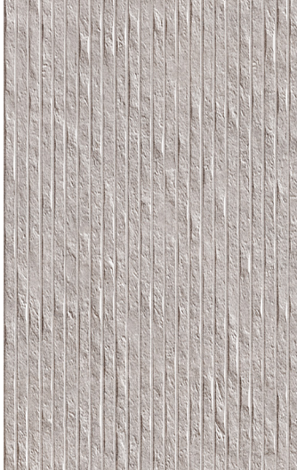
25 x 40 cm (10" x 16") Brick Relief Decor GE.GN.TPE.1016.MT.DC