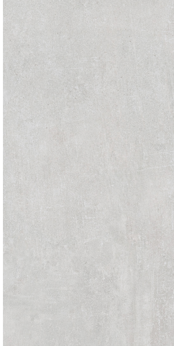
30 x 60 cm (12" x 24") GE.GN.LGR.1224.MT