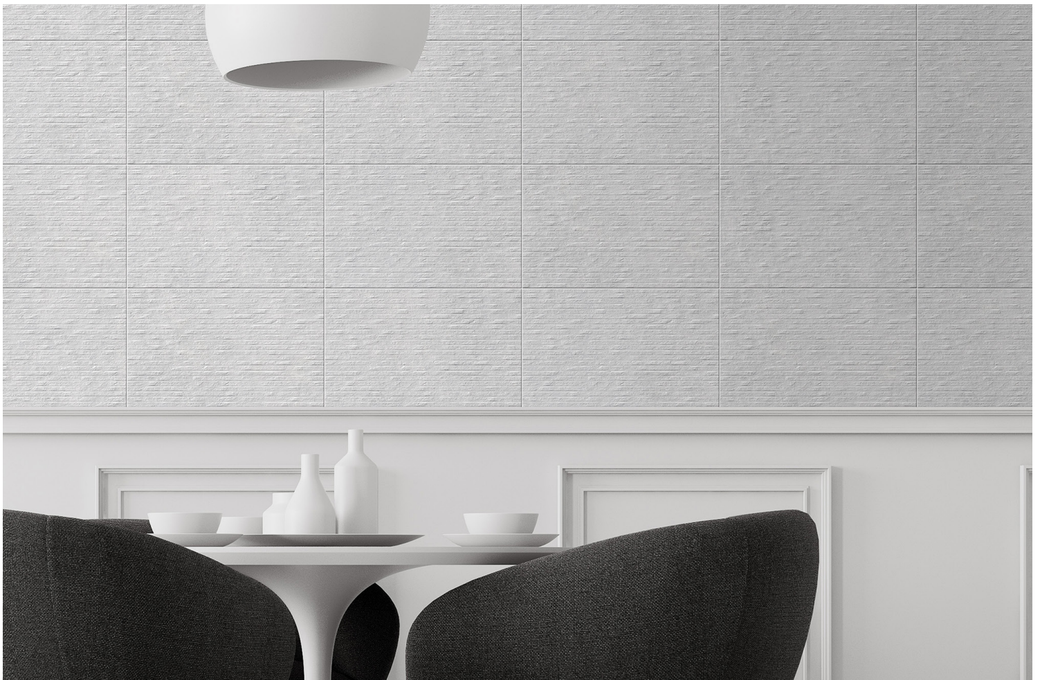
WHITE 10" x 16" Matte Decor