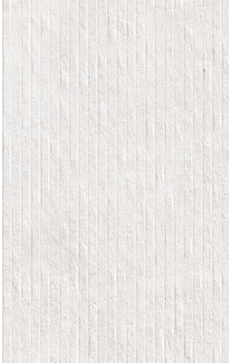
25 x 40 cm (10" x 16") Brick Relief Decor GE.GN.WHT.1016.MT.DC