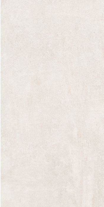
30 x 60 cm (12" x 24") GE.GN.WHT.1224.MT