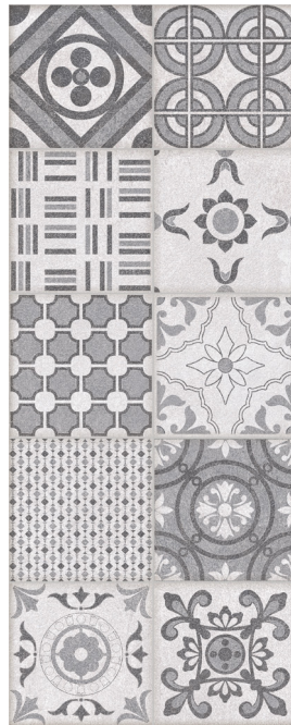
GREY PATCHWORK DECOR 20 x 50 cm (8" x 20") GE.GN.GRY.0820.MT.DC

All items shown in this document are part of Olympia's stocking program. For special orders, please contact your Olympia Tile Sales Representative.