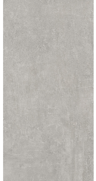
30 x 60 cm (12" x 24") GE.GN.GRY.1224.MT

All items shown in this document are part of Olympia's stocking program. For special orders, please contact your Olympia Tile Sales Representative.